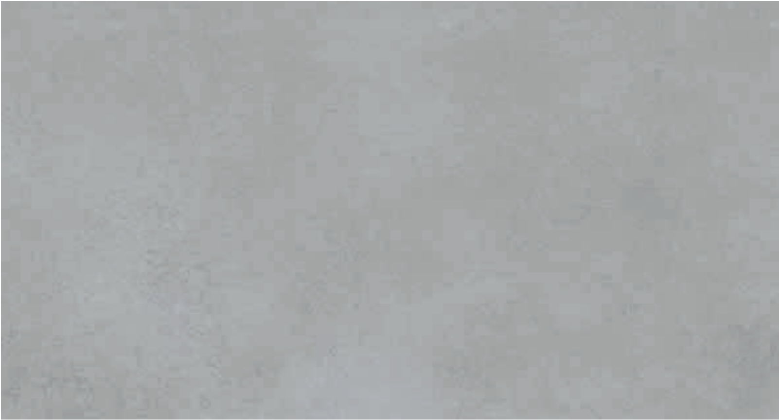
ES1722362 AUTHENTIC CONCRETE - TITANIUM