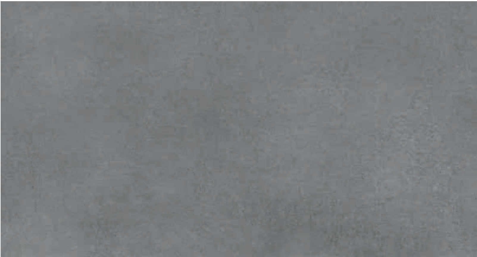
ES1722367 AUTHENTIC CONCRETE - STEEL