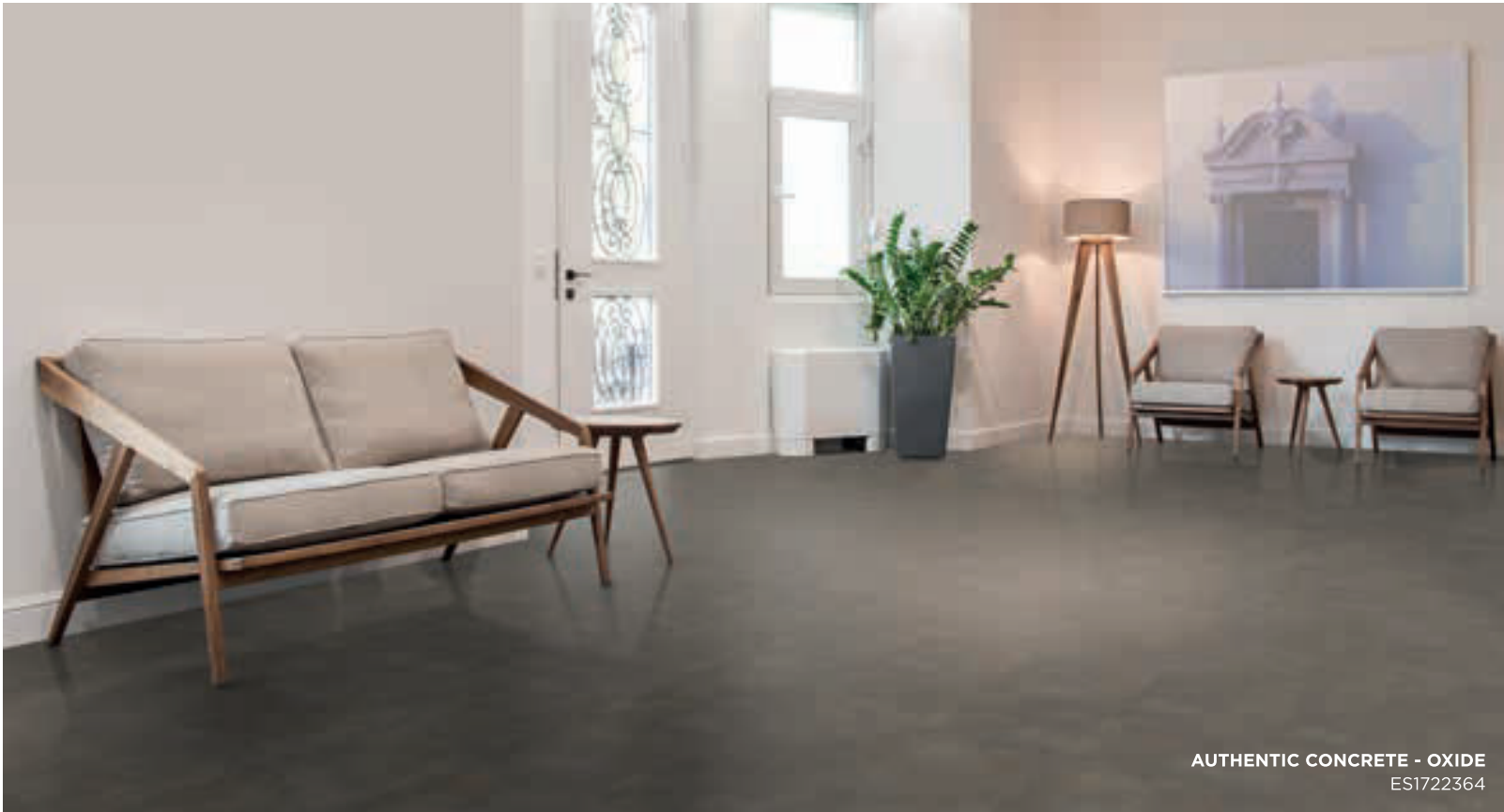
AUTHENTIC CONCRETE - OXIDE ES1722364