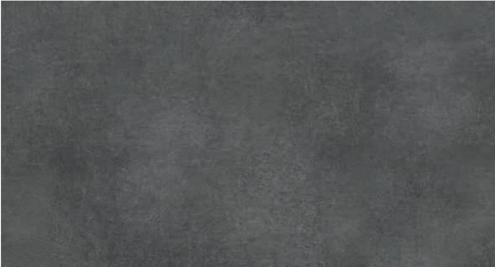
ES1722369 AUTHENTIC CONCRETE - LEAD