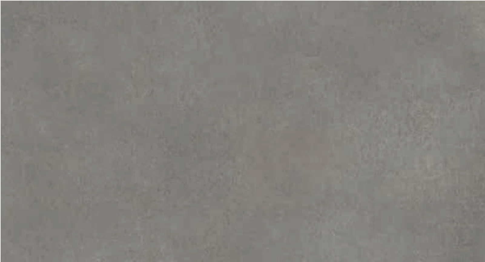
ES1722360 AUTHENTIC CONCRETE - PEWTER