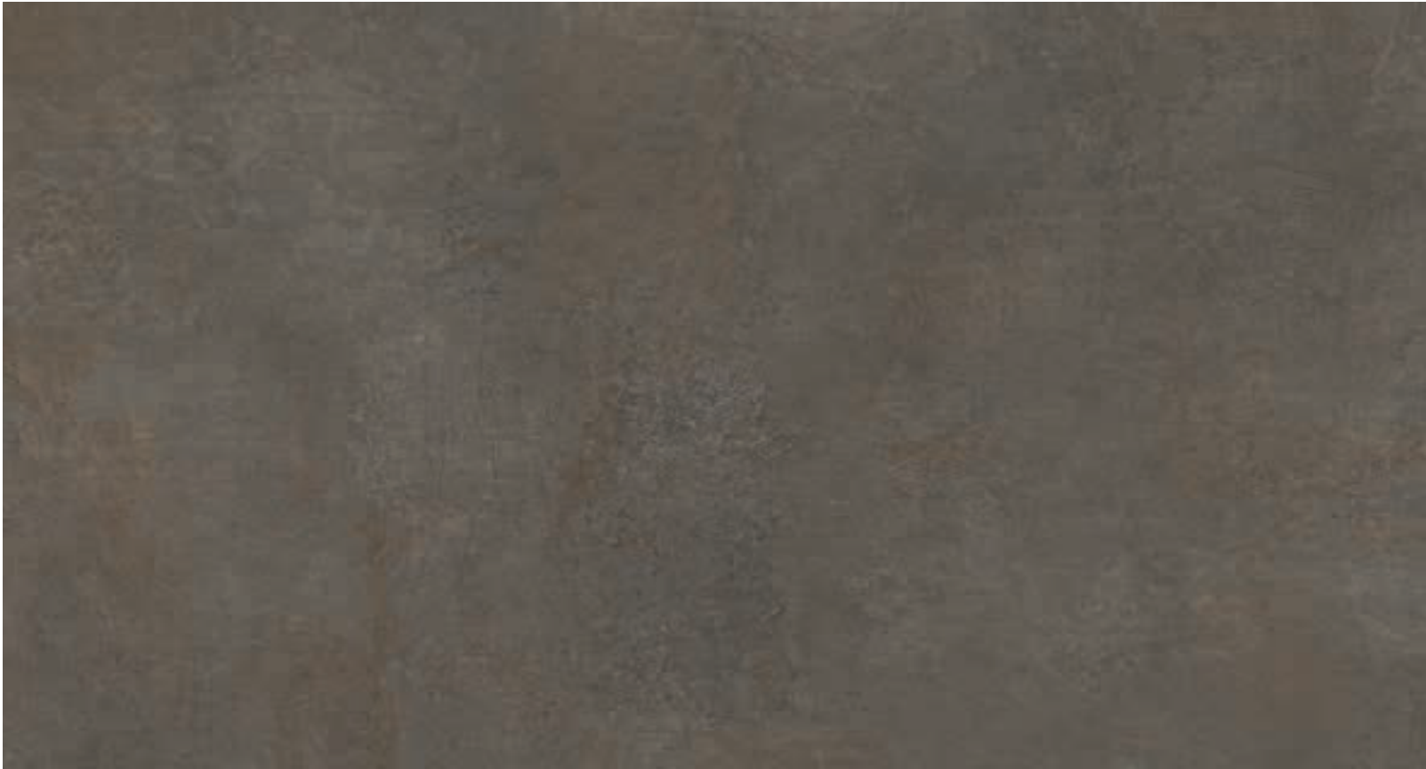
ES1722364 AUTHENTIC CONCRETE - OXIDE